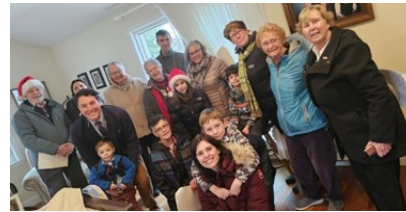
2023 Caroling Group

Come kick off Christmas week with this annual beloved event. It is heart warming and fun to sing to some of our church family outside their home. All ages love it!