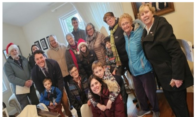
Last year's group had a great time!

Come kick off Christmas week with this annual beloved event. It is heart warming and fun to sing to some of our church family outside their home. All ages love it! Join us!