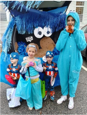
Halloween 2023 was fun!